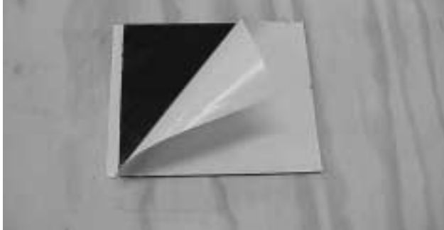
Step 1: Remove liner from both sides of pad.

Refer to the Wall Opening Protective Material (CLIV) listing in either the 3M Fire Protection Products Applications and Specifiers Guide or the UL Fire Resistance Directory Volume 1 for MPP+ Moldable Putty Pad application on UL Listed metallic and nonmetallic outlet boxes. No special skills or tools are required. To ensure adequate adhesion, all surfaces shall be clean and free of dust, grease, oil, loose materials, rust or other substances.