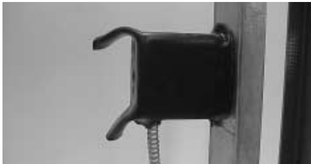
Step 5: Extra putty will pleat at corners after pad has been applied to surface of box.