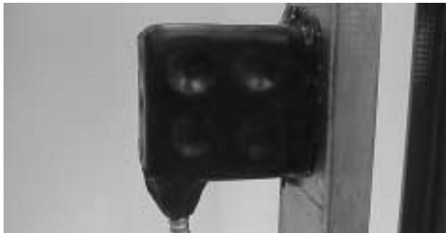
Step 6: Trim excess putty from corners and apply it to conduit fittings or cables connected to the box. Ensure pad is pressed firmly to surface of top, back, bottom, and side of box.

Warranty and Limited Remedy. This product will be free from defects in material and manufacture for a period of ninety (90) days from date of purchase. 3M MAKES NO OTHER WARRANTIES INCLUDING, BUT NOT LIMITED TO, ANY IMPLIED WARRANTY OR MERCHANTABILITY OR FITNESS FOR A PARTICULAR PURPOSE. User is responsible for determining whether the 3M product is fit for a particular purpose and suitable for user's method of application. If this 3M product is proved to be defective within the warranty period stated above, your exclusive remedy and 3M's sole obligation shall be, at 3M's option, to replace or repair the 3M product or refund the purchase price of the product.