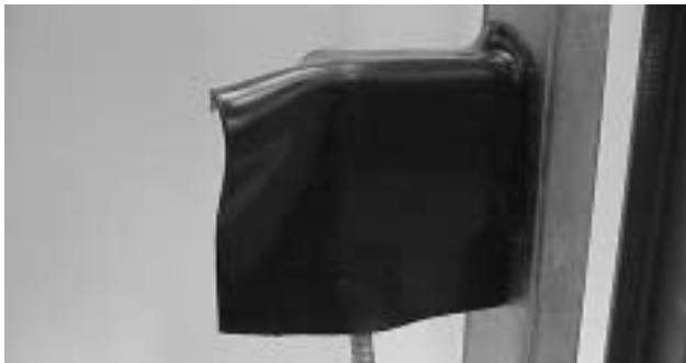
Step 3: Starting at top, align to front edge of box and overlap onto the stud 1/2 inch (13 mm).