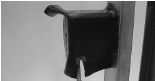
Step 4: Adhere remaining pad to box and cut to provide a snug fit around conduits or cables.