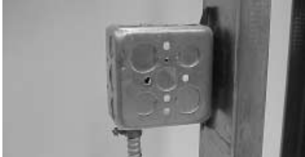
Step 2: UL Listed metallic or nonmetallic outlet boxes (refer to above listing)